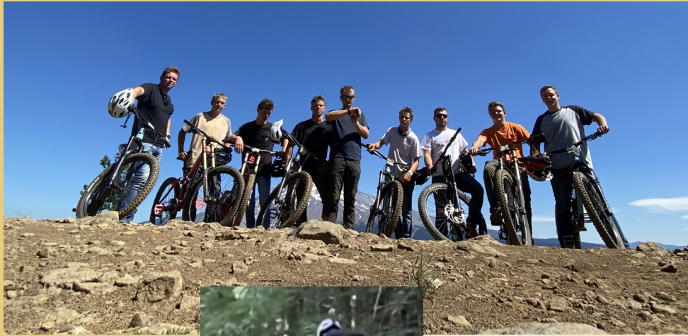
FAB Boys Downhill Mountain Biking Trip